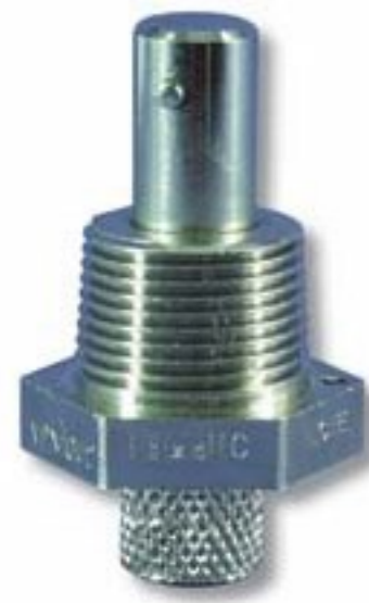
Bleed valve 0934 98