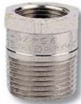
3/4" Adaptor 0954 71