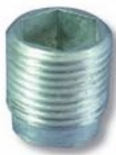
1/2" Plug 0954 80